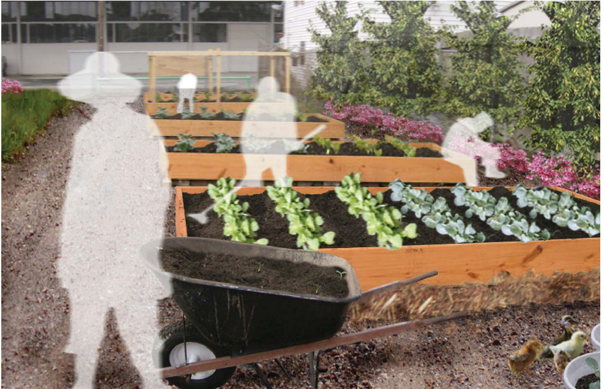
Mid-City Community Garden spring 2009