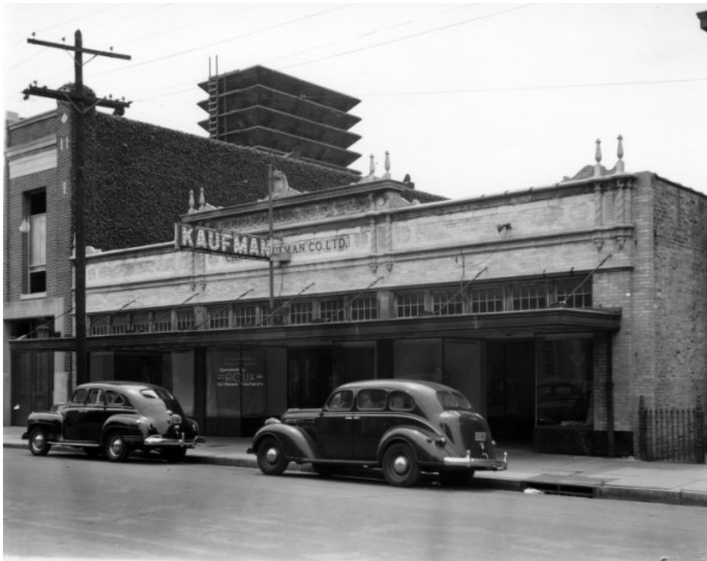
KAUFFMAN DEPARTMENT STORE, 1725 BARONNE STREET