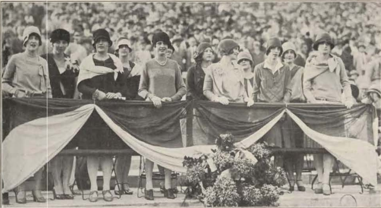
SPONSORS OF THE GEORGIA GAME