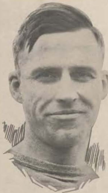
CLARK D. SHAUGHNESSY Tulane's Peerless Coach