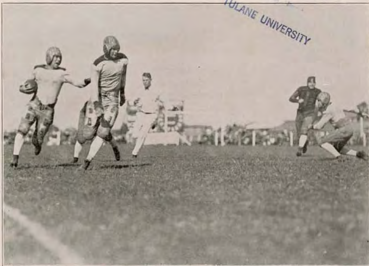
Tulane's "Big Two"