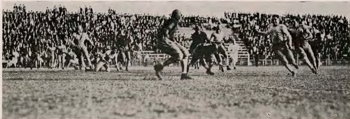
← L. LAUT... LEAPING BROWN