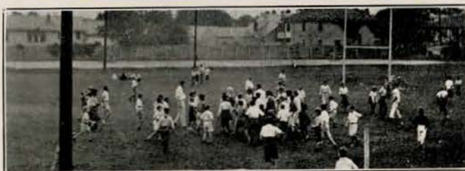
THE KIDS AT PLAY