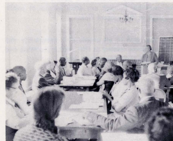
Teacher Training Class in Session

Martin Luther King, Jr., President Wyatt Tee Walker, Director