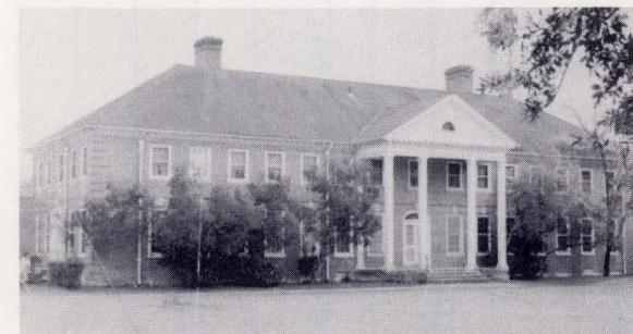
Dorchester Center, McIntosh, Georgia