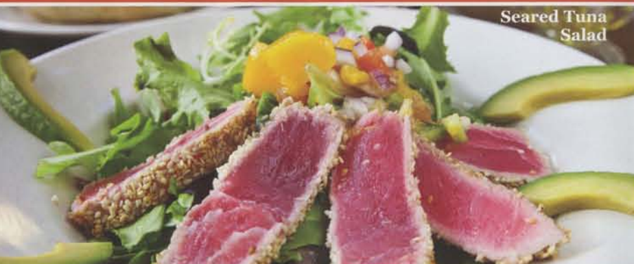
Seared Tuna Salad