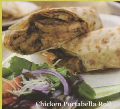
Chicken Portabella Roll