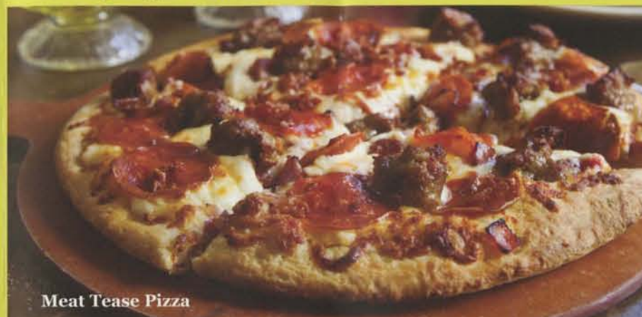
Meat Tease Pizza

Roasted eggplant, red pepper, sun dried tomato, Kalamata olives, roasted garlic, garlic herb sauce, feta & mozzarella cheese