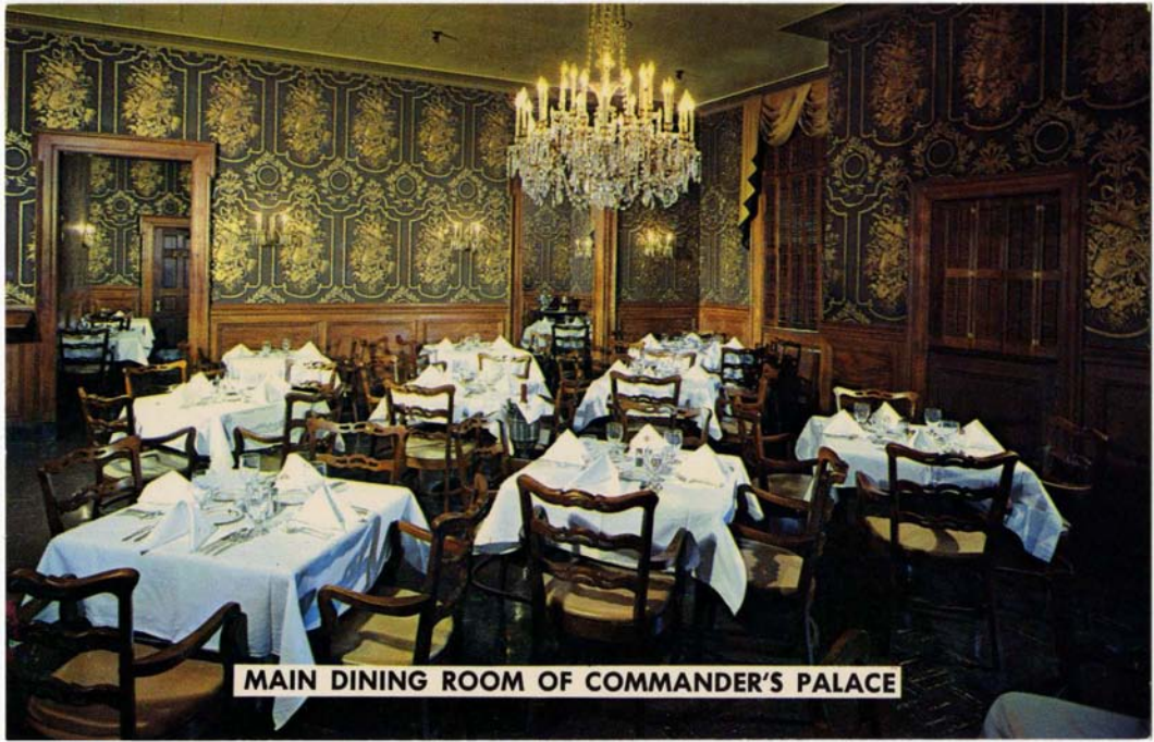
MAIN DINING ROOM OF COMMANDER'S PALACE