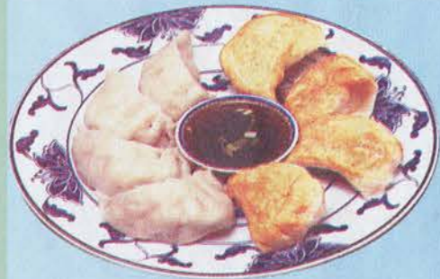
Steamed or Fried Dumplings