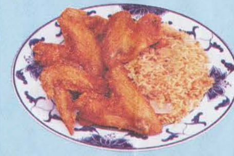
Chicken Wings w. French Fries