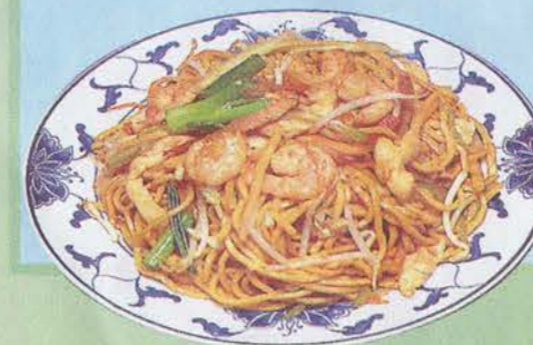
House Special Lo Mein