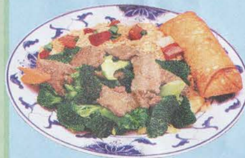
Beef w. Broccoli Combo