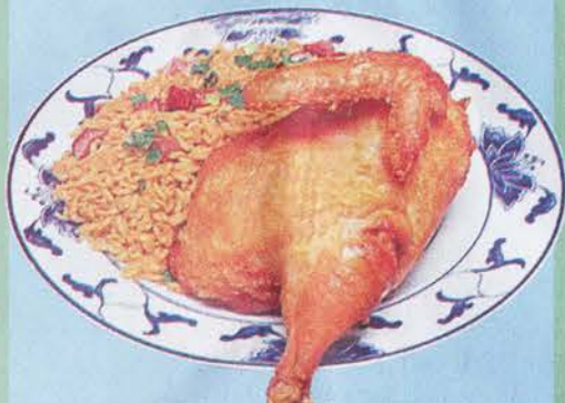
Half Chicken w. Fried Rice