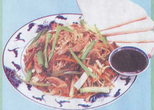
Moo Shu Pork