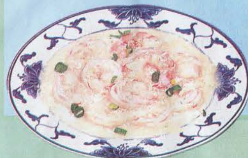
Shrimp w. Lobster Sauce