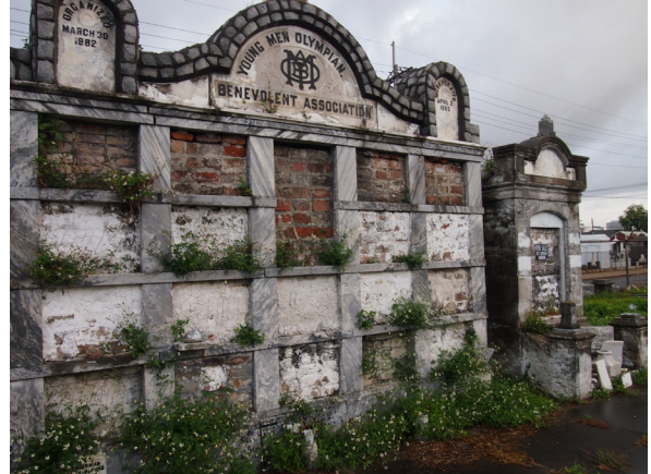
Top: St. Paul Missionary Baptist Church exterior (1958), Then and Now: St. Paul Community Baptist Church, (2009), Bottom: Odd Fellows funeral (1953), Then and Now: Lafayette #2 (2012)