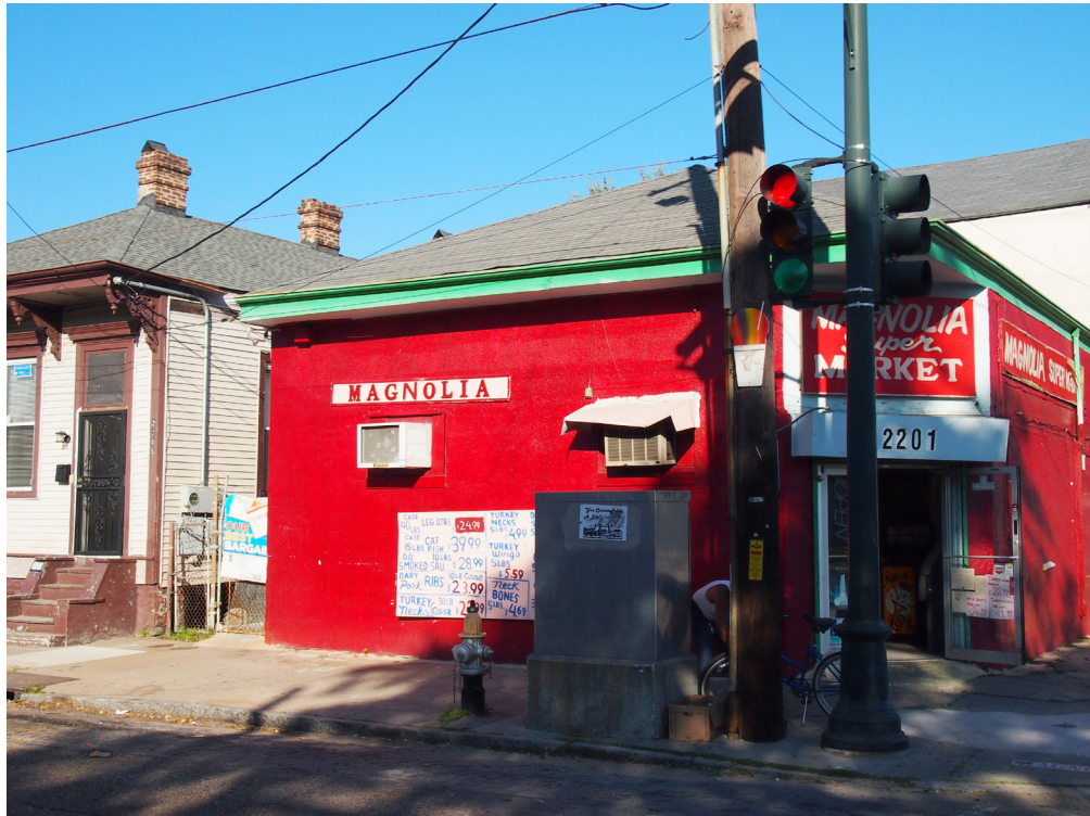
Young Tuxedo Brass Band marching and playing in a Sunday School parade (1958), Then and Now: Magnolia Super Market (2012)