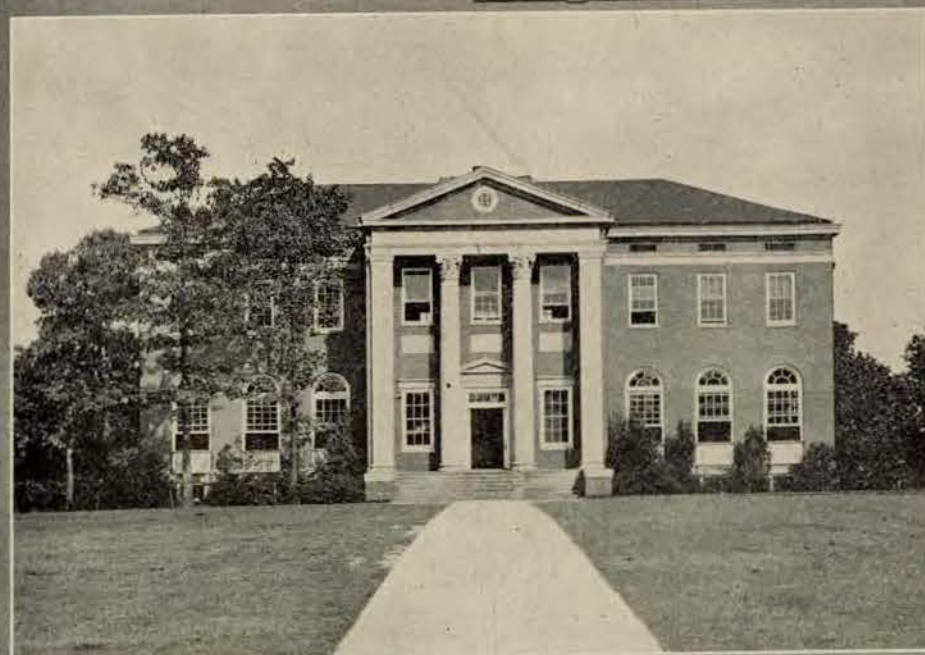
Birmingham-Southern College, an institution of some 1,400 students, located on a series of hills is noted for its natural beauty. Here are photographs of some of the buildings.